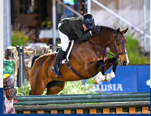
HIGH DESERT SPORT PHOTO