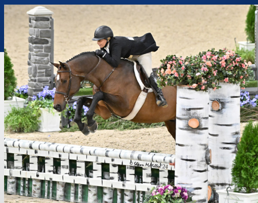
SHAWN MCMILLEN PHOTOGRAPHY