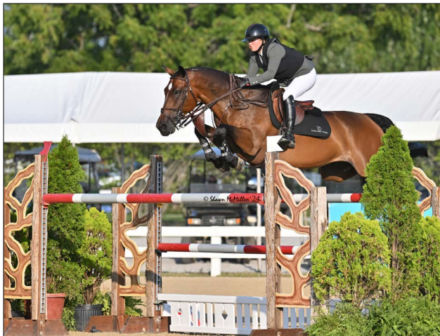
Table II, No Jump-Off